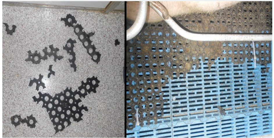
Figure 1: A 99 × 150 × 1.4-cm heavy-duty rubber mat damaged by the sow during the day prior to farrowing. Note the different sizes of fragments (7.5 to 25 cm) as well as the damaged area in the rubber mat on the right (approximately 25 × 75 cm).

mat was selected after previous experience (unpublished data) with a perforated rubber mat (heavy-duty rubber mat, Farmtek, Dyersville, Iowa; price $47.95; width × length × thickness, 99 × 150 × 1.4 cm respectively; perforation size, 2.2 cm) that showed excessive tearing and fragmenting during one lactation cycle. By 10 to 14 days post placement of the 30 Farmtek rubber mats, at least 30% to 50% of each mat was torn or severely damaged (ie, fragmented; Figure 1) due to normal wear and oral manipulation by the sow and piglets. Thus, all mats were consequently removed from the stalls. The difference in durability between these two mats suggests that the rubber-mat thickness of choice should be at least 1.9 cm to withstand the daily postural adjustments and manipulations of the sow. It should be noted that use of rubber mats should take into consideration environmental conditions, as mats may prevent sows from cooling down during hot and humid summer months. 8