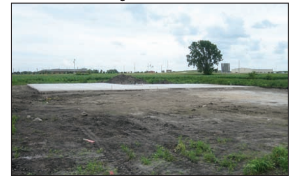
The cement footings and construction pad have been poured and await construction.